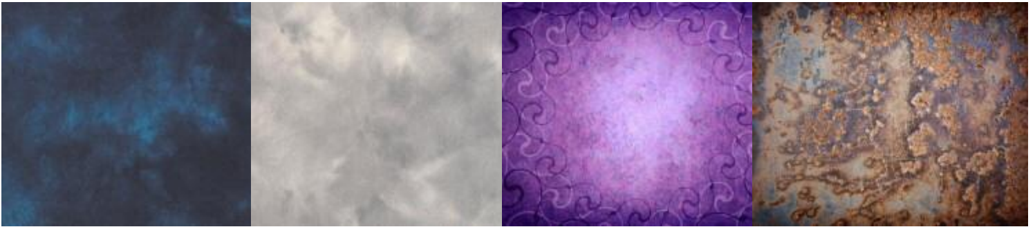
Textured Blue (Free)